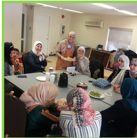
Parkwood Hills Women's Crafting Group participants 2017