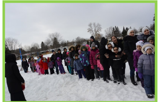
Lining up for the sleigh rides at the Winter Fun Day