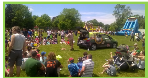
Parkwood Hills Fun Day