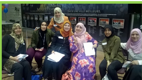
Members of the Women’s Crafting Group getting ready to present at the CDF Learning Forum at City Hall