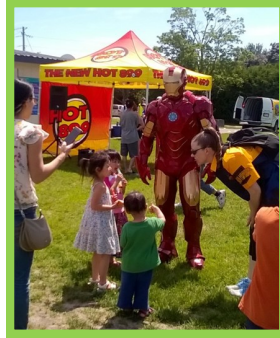
Parkwood Hills Fun Day 2017