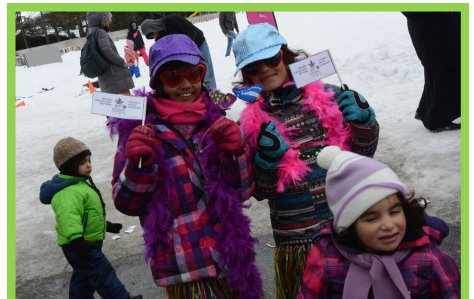
Winter Fun Day participants having FUN!