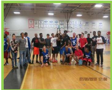
Youth Basketball Tournament