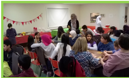
Community Bingo Night!