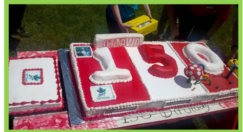
Parkwood Hills Fun Day Cake provided by McDaniel's Independent Grocer