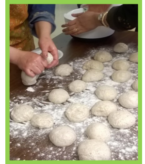
Women’s Crafting Group