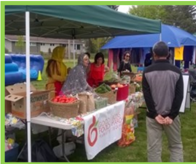
Parkwood Hills Good Food Market