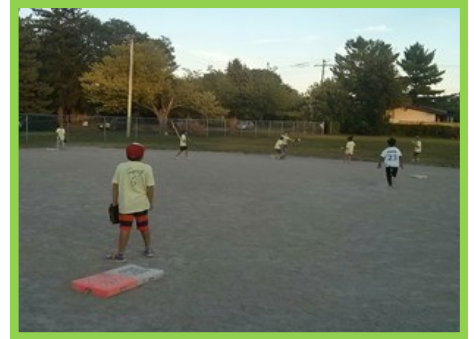
Junior Baseball Team