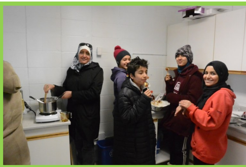
Volunteers help make maple taffy for the fun day!