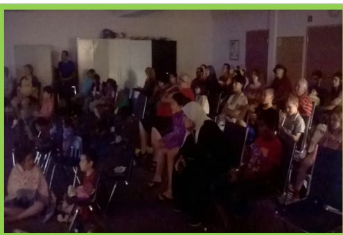
Moana Movie night at Parkwood Presbyterian