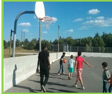
Basketball at Manordale